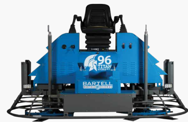
TITAN 96 HYDRAULIC