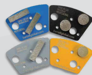
TOOLING & CONSUMABLES