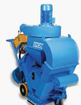
SPE 20ES ELECTRIC DRIVE