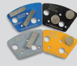
TOOLING & CONSUMABLES